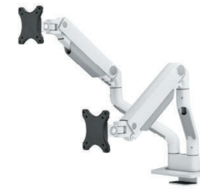
DS70S-950BL2 / WH2 Screen size: 17-35" Capacity: 18 kg (2x) Strengthened head