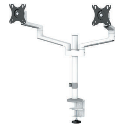
DS60-425BL1 / WH1 Screen size: 17-27" Capacity: 8 kg