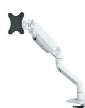
DS70S-950BL1 / WH1 Screen size: 17-49" Capacity: 18 kg (curved 15 kg) Strengthened head