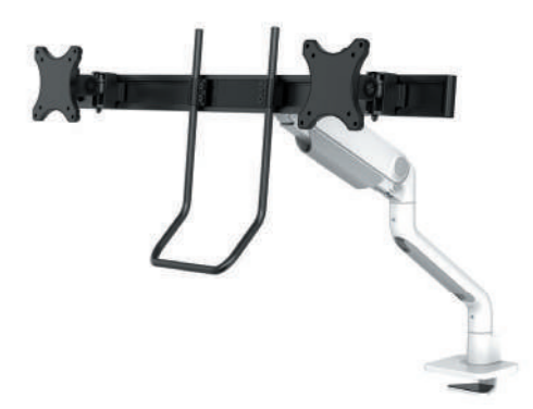
DS75S-950BL2 / WH2 Screen size: 17-27" Capacity: 8 kg (2x) Large cockpit set-up possible