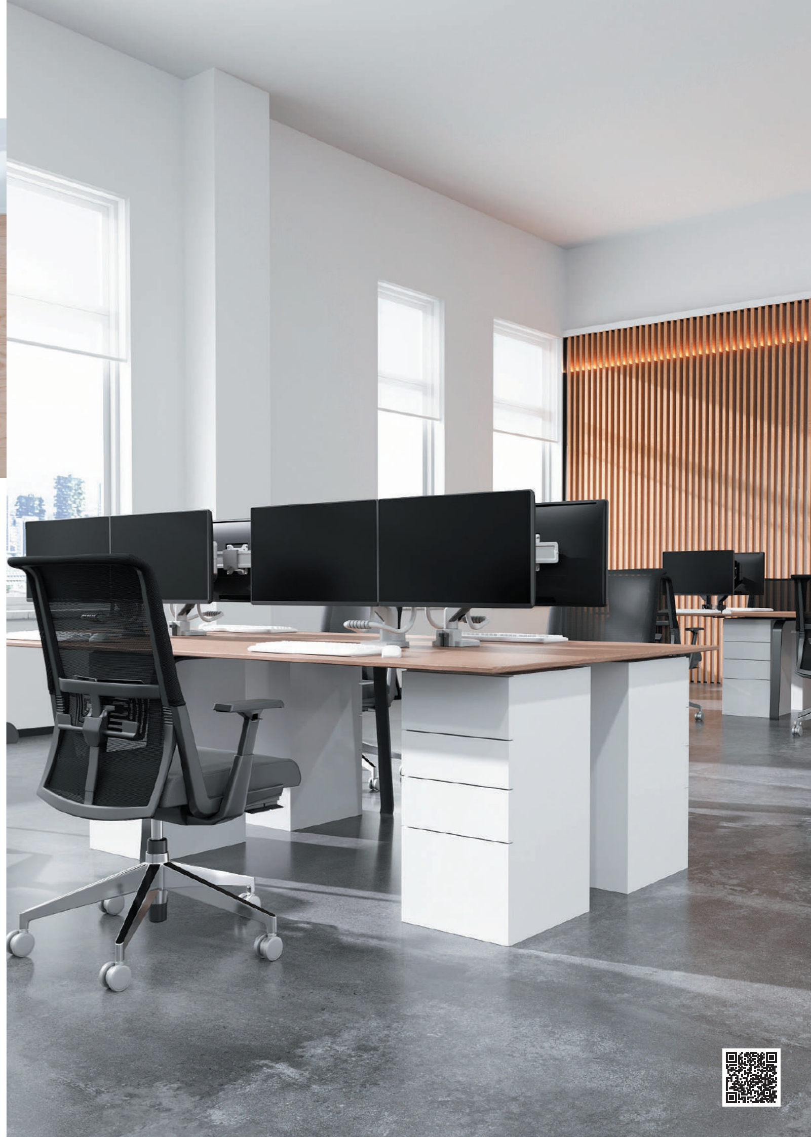
DS75-450BL2 / WH2 Screen size: 17-32" Capacity: 8 kg (2x)